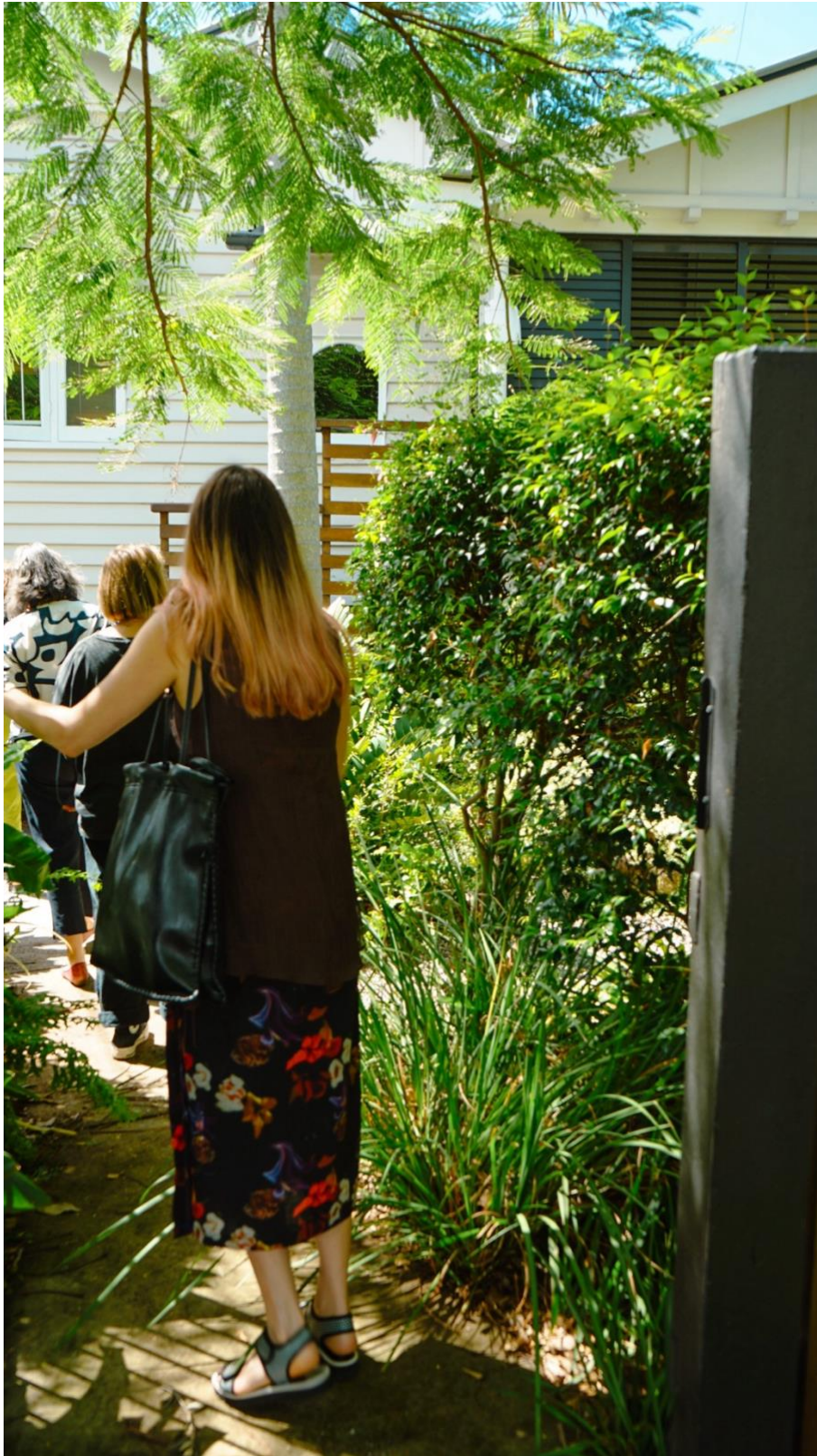
I will cross some coarse garden gravel and a patch of grassy lawn.