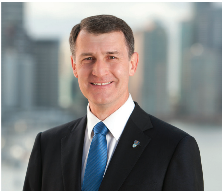
Lord Mayor Graham Quirk

As Australia's new world city it is important that we grow our city's cultural life and build upon the city's sense of identity. Museum of Brisbane is one way we provide opportunities for residents and visitors to learn more about Brisbane and promote its unique and diverse culture.