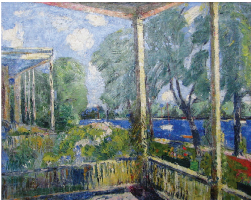
Miles Evergood The Veranda, Brisbane 1931 Purchased 2014, Museum of Brisbane

The City of Brisbane Collection is owned by the people of Brisbane through Brisbane City Council.