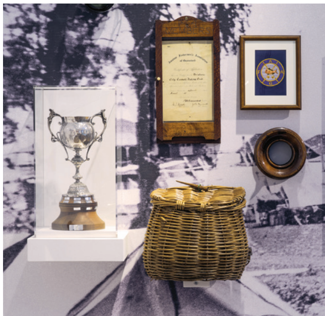
Objects featured in The many lives of Moreton Bay