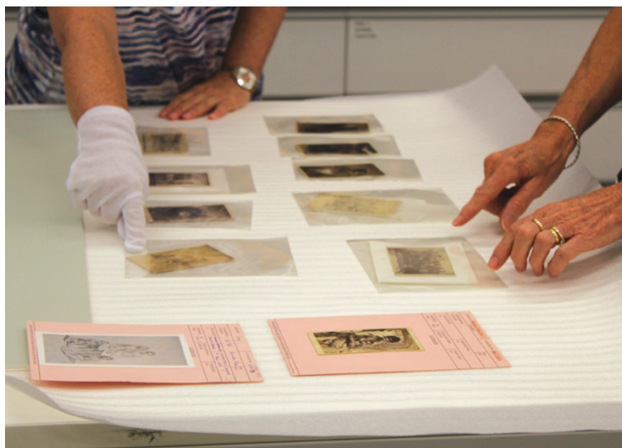
Preparations for Captured: Early Brisbane Photographers and their Aboriginal Subjects