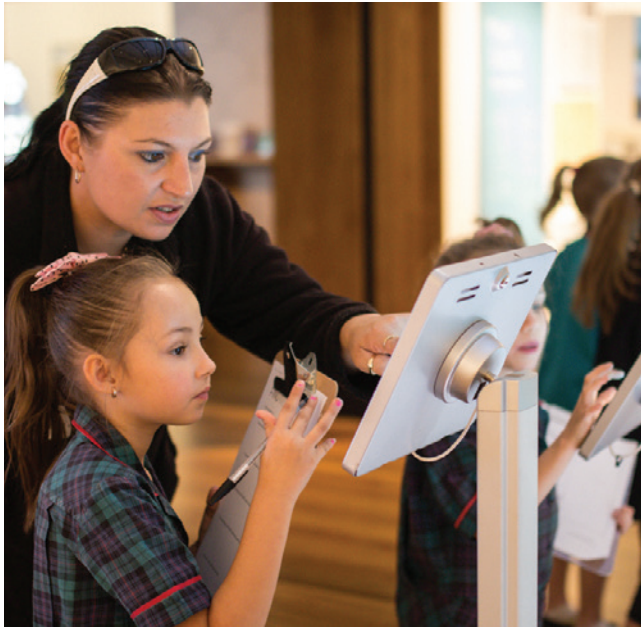
School Group interacting in The many lives of Moreton Bay